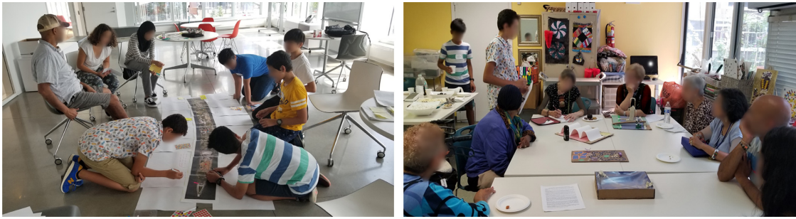
Figure 1: Mapping activity where youth marked the island usage patterns, visions, and sentiments (left) and final presentation at the senior center (right)

deformation — of physical artifacts” [93]. Their formulation posits unmaking as a valuable extension to making, achieved by digitally designing and fabricating objects that unmake in pre-defined ways post-making. Wu and Devendorf [105] develop a pipeline of hardware, material modifications, and digital design tools for unfabricating smart textiles to sustainably mend, disassemble, and reuse them. Murer et al. propose uncrafting as “the thoughtful, reflective process of disassembling . . . something which could be developed into a practice that – not unlike other studio crafts – requires particular skills, involves specific ways of reflection, and develops and according set of terms and framings” [78]. Uncrafting is geared towards material exposition, inspirations drawn from its inherent components, inquiry into the underlying design, and form-function exploration. Lastly, Pierce formulates undesigning as “the intentional and explicit negation of technology” attained through a range of strategies such as inhibition, replacement, and erasure [81]. Our formulation of critical unmaking builds on the rich potentiality identified in this literature, but is embedded more in social processes rather than physical matter, and activated at the confluence of the design as provocation, friction, and co-design with youth.